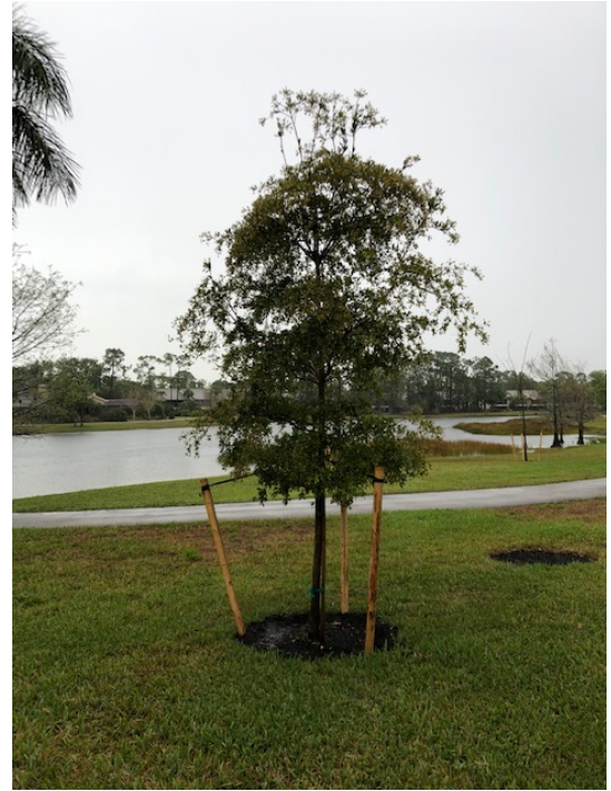
A Shady Lady beautifies an area around the lake

As a reminder, homeowners living on the lake should consider leaving an 18 to 24-inch buffer; this buffer left unmowed along the water's edge aids in preventing fertilizer/nutrients from entering the lakes.